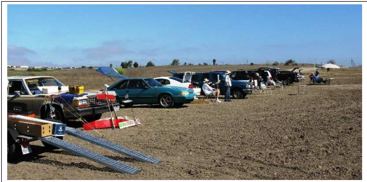
July 2013 Outdoor Contest - The flight line.