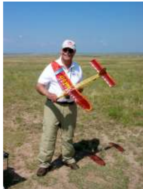
Murph, the Happy Golly Fl