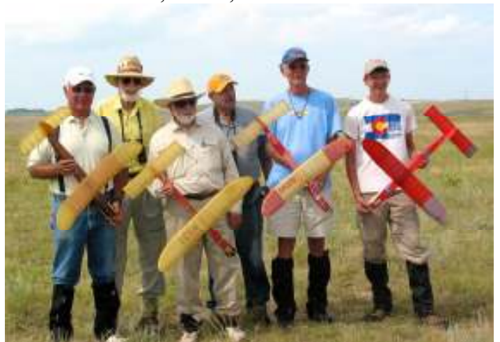
The Smiling Crowd of Gollywock flyers