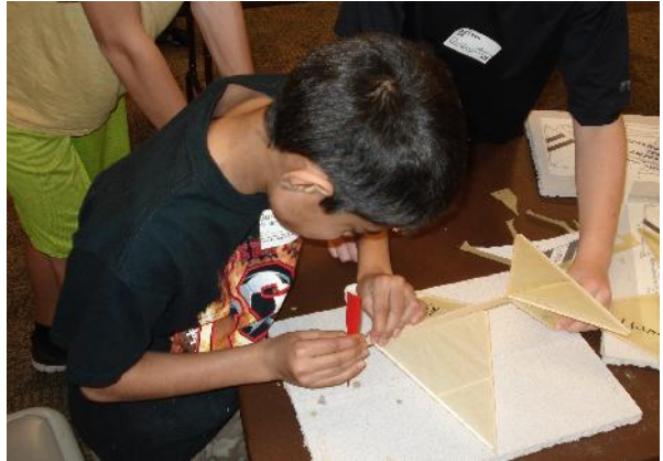
The intense focus...