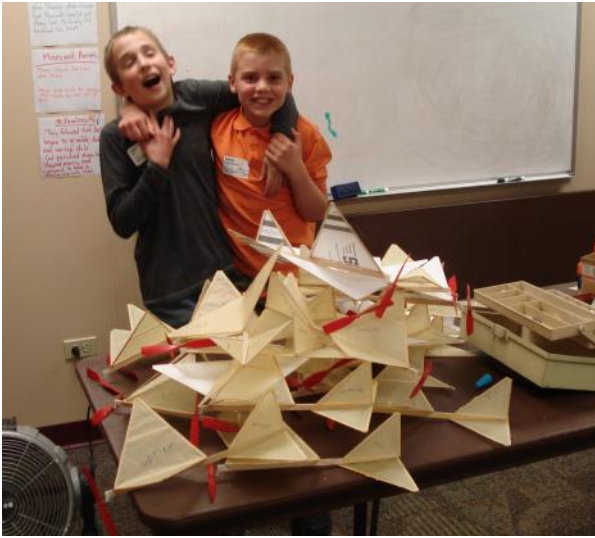
Two Energetic Young Lads with A pile of Darts