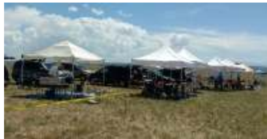
Tent city on Saturday afternoon. Those cumulus clouds in the background are an indication of the great lift that was available all day.