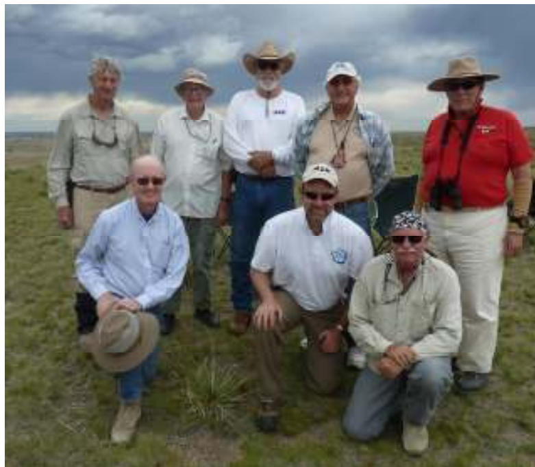
F1E "Crew" L-R