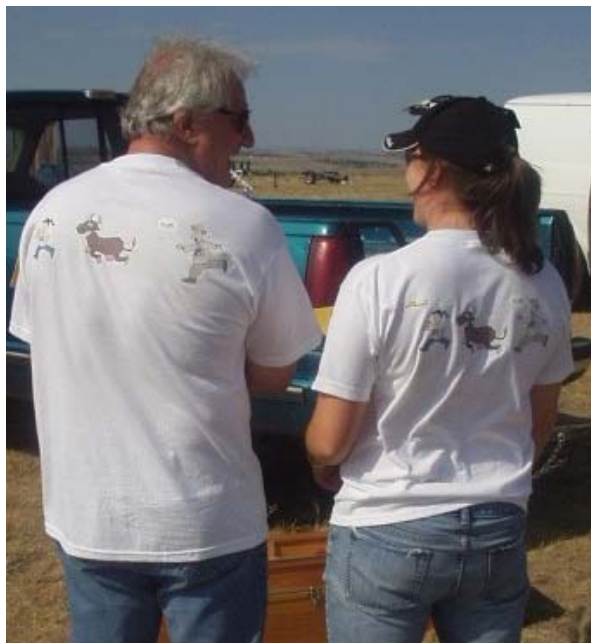
The "PANGELL TACTICAL TEAM"