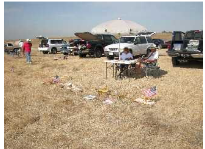
July 4 TH , Mooney Judging Line Up

Our status as a Non-Profit Club is secure. The fiscal year ended with a loss of $822 .