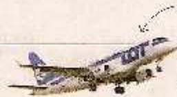
LOT Polish Airlines Flight 15, From Warsaw to Newark