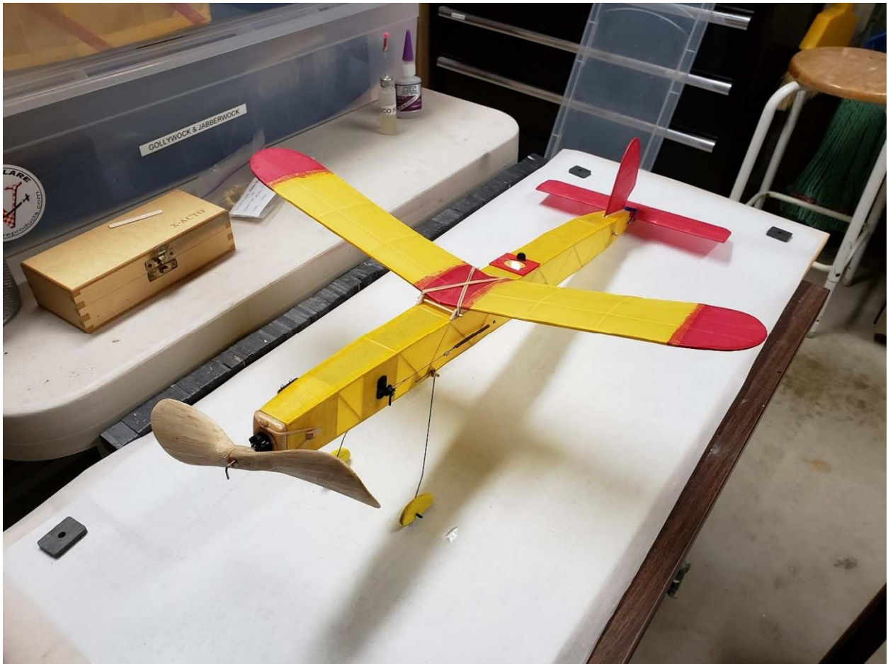
Nose Block Retention Scheme on Alligator Embryo

For smaller models I use 3/32-inch square Basswood strips to make the retainers. You can use larger 1/8-inch square Basswood strips to make the retainers for larger models. You could use very hard balsa wood instead of the Basswood. If there is tissue on the fuselage where the retainers are mounted, you might want to poke a few tiny holes with a pin in the area where the retainers will be glued. This is not necessary where the fuselage has balsa wood sheeting and no tissue covering. I use CA to make sure the retainers can't break free. The retainers should be long enough, e.g. about 1/4-inch, to give enough gluing area so that they will be secure.