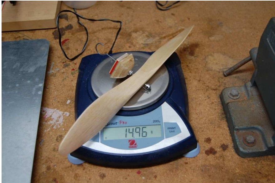
13-inch Free Wheeler Prop Lost at Perris, California When Ejected from My Gollywock