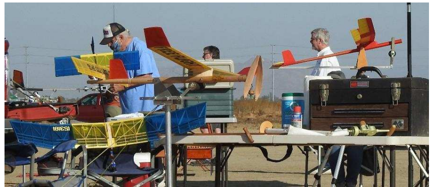
The Flight Line