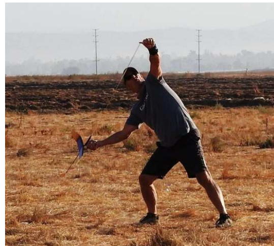
Tim Batiuk – October Flying