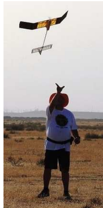
Stan Buddenbohm →