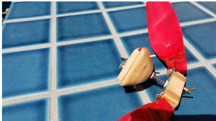
Rounded Upper Edge of Plug on Nose Block

Five or six years ago I came up with a simple solution for preventing the nose block from falling out when the model is aloft. In my outdoor sport models with free-wheeling props I usually incorporate a retention mechanism for the nose block. It is pretty simple, and very reliable. I drill two 3/32-inch holes in the top and bottom sides of the nose block at a 45-degree angle and glue in short stubs cut from a round wooden tooth pick. See the picture of my Alligator Embryo reproduced below. Don't ask why I call it the Alligator. Note that the stubs are angled forwardly. Then I glue retainers made of short segments cut from Basswood strip on opposite sides of the fuselage. They are cut with 45-degree angles on the front and rear ends - in parallel fashion. The retainers are glued onto the fuselage so that their rear ends form hooks. The forward ends give streamlining and look good. Of course, you would never use this scheme on a scale model.