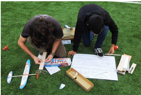
Alpha Glider building to plan