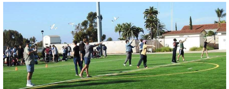
Mass launch rubber power