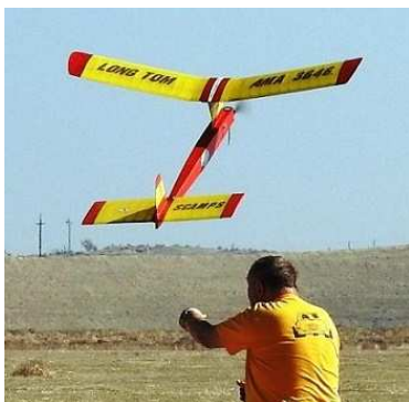
← Hal Cover