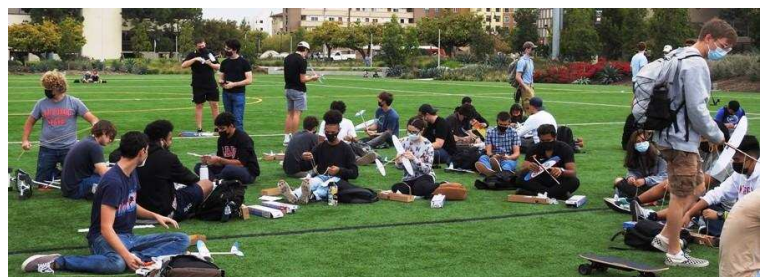
Pit area on Soccer Field