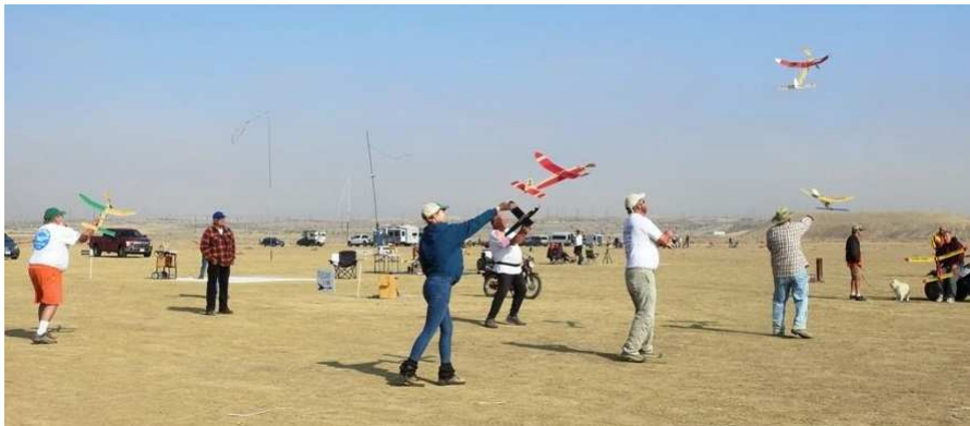
← Gollywock Mass Launch