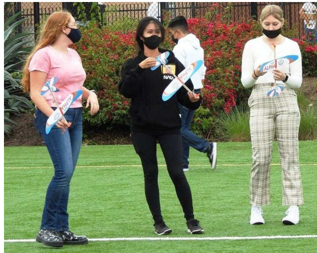
Women in Aviation at SDSU