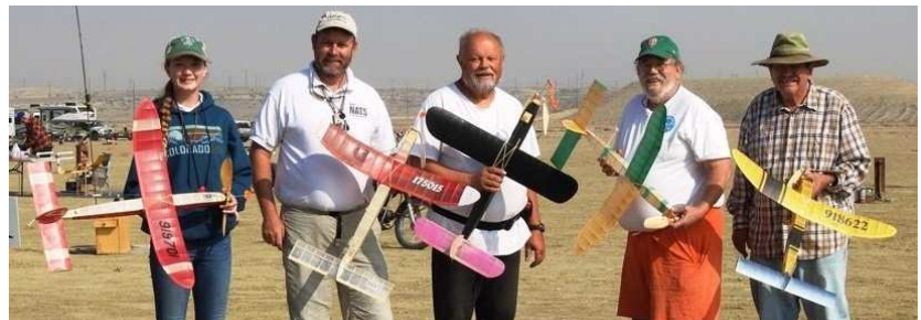
Gollywock Mass Launch Pilots