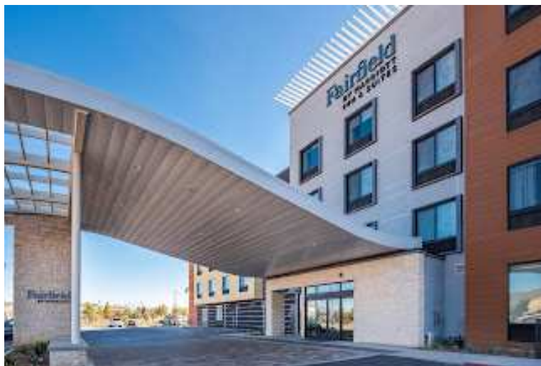
Fairfield Inn & Suites, Menifee, California

Some fliers have been looking for an alternative to the Red Lion Inn & Suites in Perris. Almost two years ago I wrote an article about a new hotel under construction about 3 miles north of the flying field at Perris. Well, it turned out that the building under construction was not a hotel. However, a brand-new Fairfield Inn & Suites opened in Menifee earlier this year. It is located at 30140 Town Center Dr, Menifee, CA 92584 which is about 9 miles from the flying field in Perris. It's a quick drive up Highway 215. When I checked the rates at the Fairfield Inn, they were similar to those of the Red Lion. The new hotel is located near a number of restaurants including one operated by the popular Texas Roadhouse chain. The Fairfield Inn is part of the Marriott Hotel chain. The new hotel offers typical amenities including a pool, an exercise room, WiFi, and complimentary breakfast.