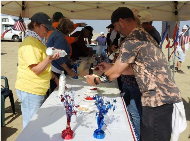
Ice Cream Social