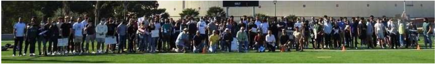
SDSU Students & Supporters standing in back, with Mentors kneeling in front

On Oct. 6, at the San Diego State University soccer field, the Model Airplane Flying class was conducted. It was well attended by some very bright, interested, articulate, attentive, and polite students. Very impressive. Looks like our future might be in good hands after all!