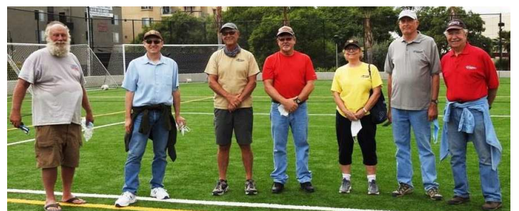
Mentor group photo →