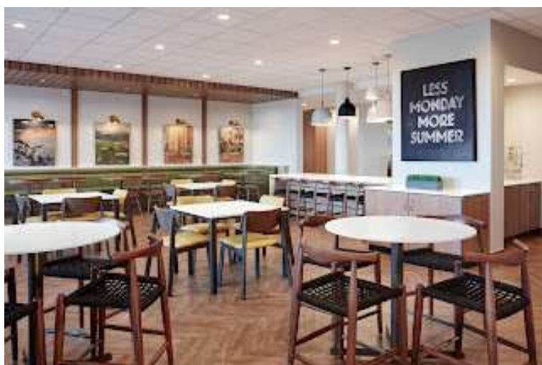
Breakfast Room - Fairfield Inn & Suites, Menifee, California