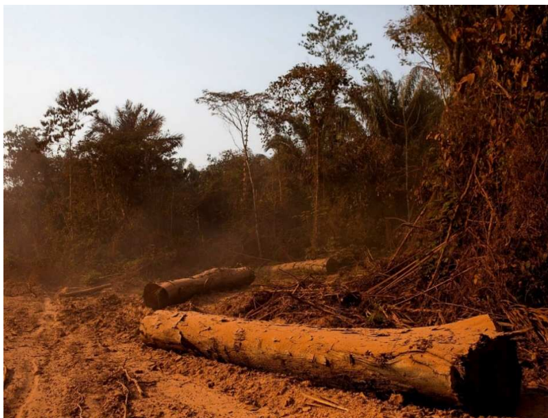
Harvesting of Balsa Wood Logs in South America

Wind turbine blades now are as long as 100 meters. The outer surface of these blades is epoxy-impregnated fiberglass or some other composite material. But you guessed it, the interior of wind turbine blades is balsa wood because of its lightness and stiffness. Each blade can consume 150 cubic meters of balsa wood! Polymer substitutes like PET (recycled plastic bottles) are available but more expensive. Modern wind turbines were developed in Germany and the Netherlands, but like almost every other mass-produced product they are now mostly manufactured in China. I have read that the Chinese have purchased most, if not all, of the balsa wood plantations in Ecuador. Prices for balsa wood have increased dramatically in the last five years. The price of balsa wood logs is now so high that illegal cutting takes place in Ecuador.