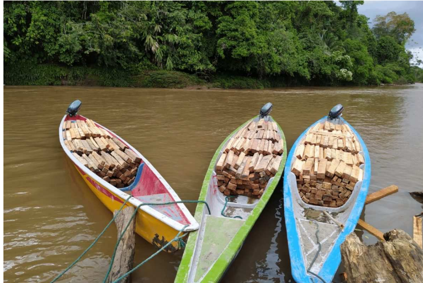
Transporting Segments of Balsa Wood Logs Via Canoe in South America

The huge increase in demand for balsa wood has caused rampant deforestation, prostitution, drug abuse, littering, and river pollution in Ecuador. So, deforest the rain forest for wind turbines and save the planet. That makes a whole lot of sense, doesn't it? What do you think powers the ships that transports the balsa wood logs to China and then the wind turbine blades all around the world? Adding insult to injury, when the wind turbines are decommissioned after a short life it costs too much to salvage and recycle the immense amount of balsa wood inside each blade.