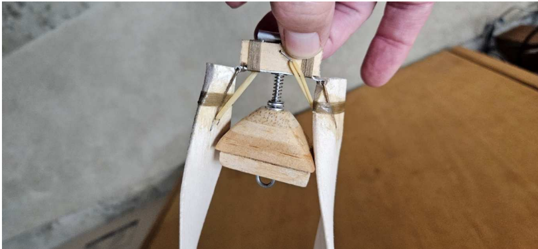
Blades Folded with Assist from Rubber Bands

the hooks are positioned so that each rubber bands extend over the middle of its corresponding hinge assembly. Rich uses segments of sewing pins with heads instead of hooks.