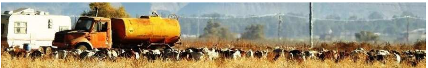
A herd of Goats attending to field maintenance