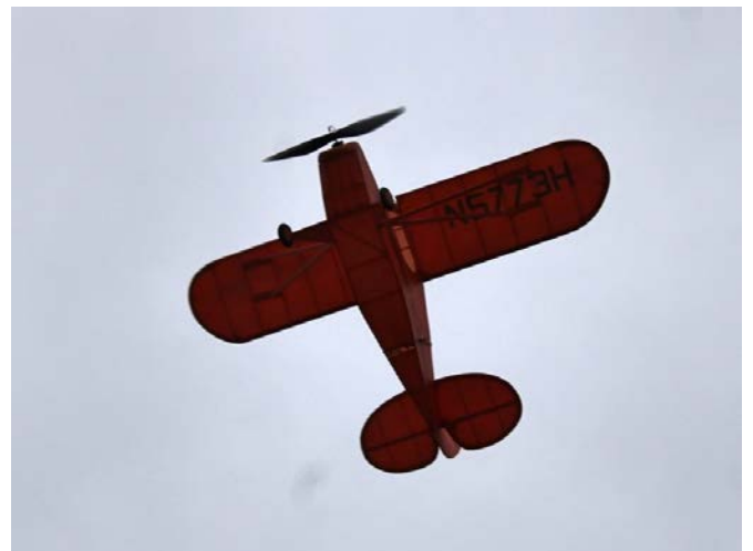
Gibbs, The launch and a great overhead view