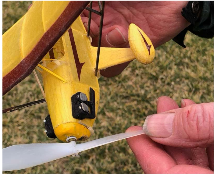
Bruce Foster Showed up with this Cutie, Get a load of the engine